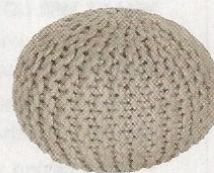
Surya pouf, $135, shop.projectnursery.com