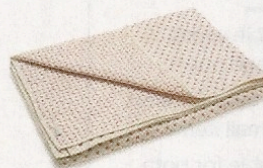
Little Auggie quilt, $85, littleauggie.com

A few fine finds to get you started on a similar nursery design.