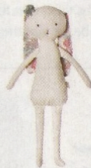
Maileg rabbit, $40, perfectlysmitten.com