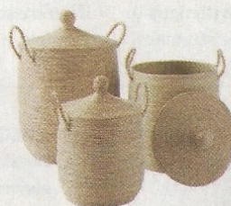
Serena & Lily La Jolla baskets, from $78, serenaandlily.com

Have a drool-worthy baby room at your house? We want to see! Email a few photos to editor@pnmag.com with "Nursery" in the subject line.